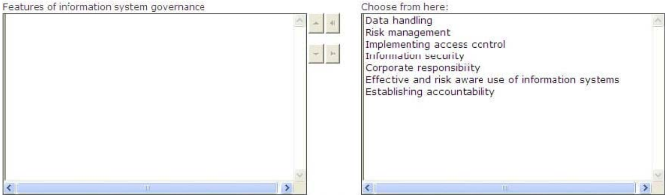
*Sequence of the selected item is not required.