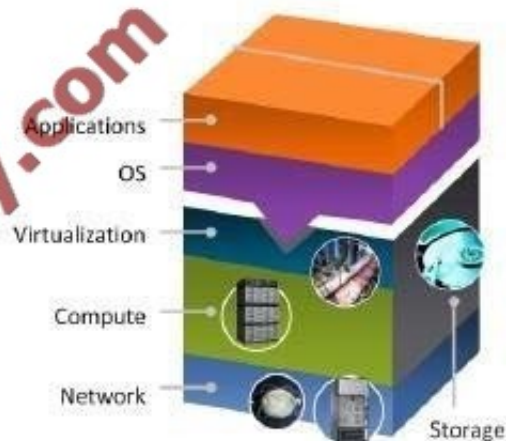
Vblock Infrastructure Package

Vblock is completely integrated cloud infrastructure offering that includes compute, storage, network, and virtualization products. These products are provided by EMC, VMware, and Cisco, who have formed a coalition to deliver Vblocks. EMC E10-001 Student Resource Guide. Module 13: Cloud Computing